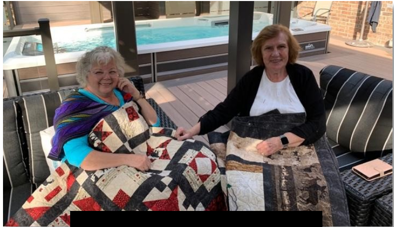
One of their Hug Block Quilts