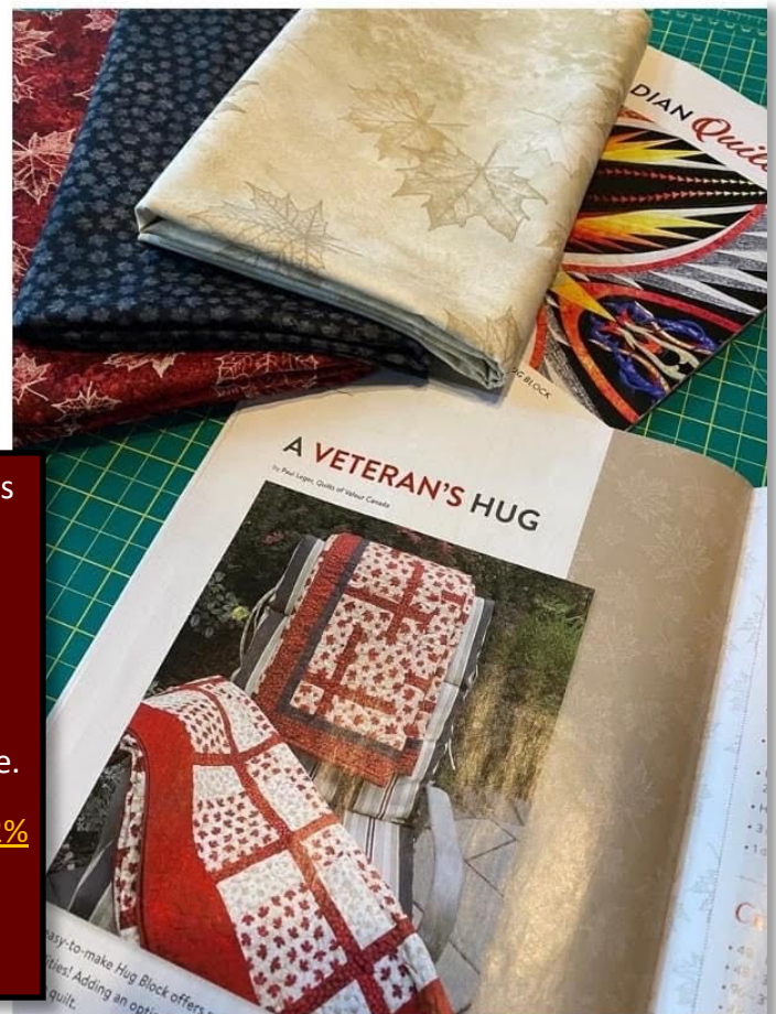
A Veteran's Hug - Quilt kit by Paul Leger

https://www.quiltsofvalour.ca/online-store/A-Veteran%E2%80%99s-Hug-Quilt-kit-by-Paul-Leger-p503376757