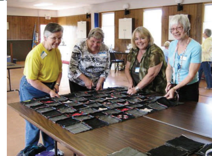
Working on a quilt