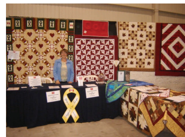
Ottawa Valley Quilt Show

Two quilting bees are scheduled for the fall, one on September 19 and the other on November 14. The bees will be held at the Orleans United Church on Orleans Blvd in Orleans, ON from 9am - 4pm.