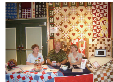
Trenton Valley Quilt