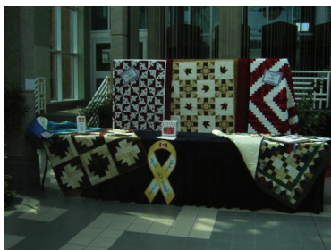
Burlington Halton Guild Show

Since April 2009, we have participated in the following quilt shows: Burlington Halton Guild (April), Ottawa Valley Quilt Show (Mother's Day weekend), Petawawa Log Cabin Quilters (end of May), and the Trent Valley Quilt Guild (June 6-8). The response was great since numerous people had not heard about QoV. We made many contacts who will support us in different ways (organize bees, donate quilts, etc.). We sent thank-you cards to all show organizers to thank them for providing a booth free of charge and for their support. A sponsorship program was launched at these quilt shows as a local fundraising initiative. The response was very positive and many individuals and organizations have indicated that they would sponsor a quilt. To date, 9 quilts have been sponsored with more to come in the fall. In recognition of the sponsorship, a picture of the quilt and label was sent to the sponsor in a thank-you card. We have also started a sponsorship photo album to use as publicity at our quilting bees and quilt shows.